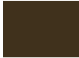
Dark Bronze *