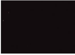
Deep Black **