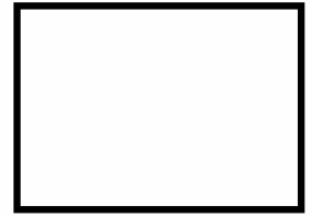
Bright White **